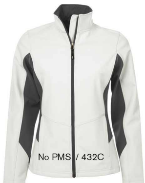
No PMS / 432C