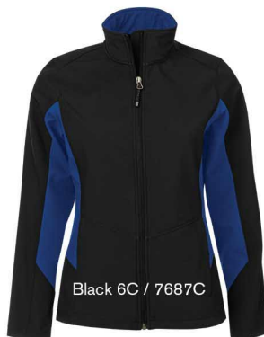
Black 6C / 7687C