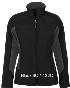
Black 6C / 432C