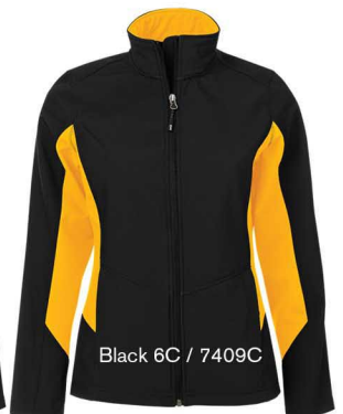
Black 6C / 7409C

Due to the nature of polyester, special care must be taken throughout the decoration process.