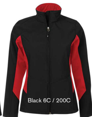
Black 6C / 200C